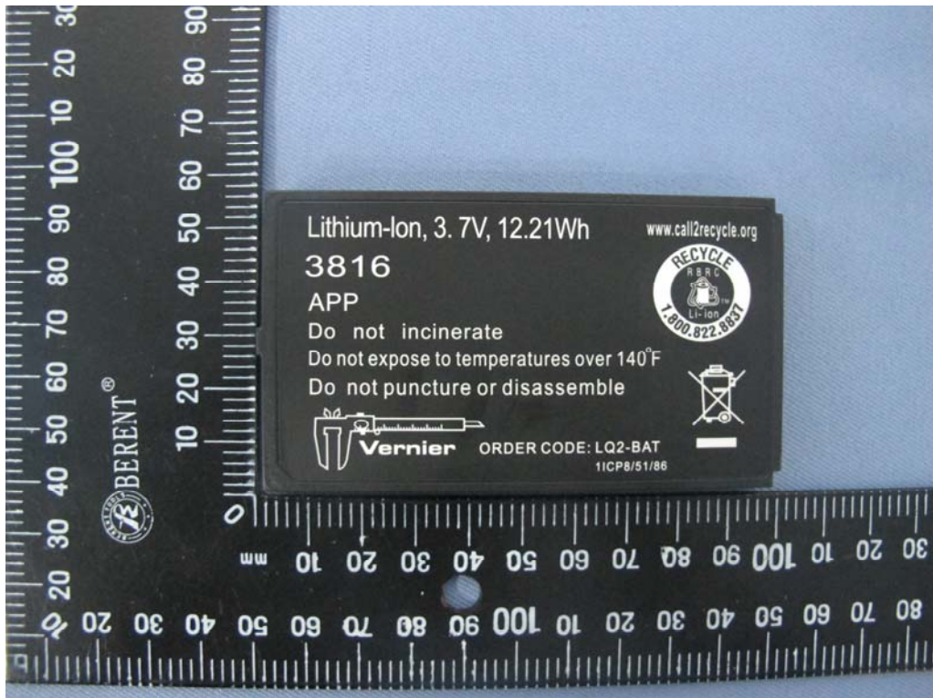
Figure 1 Overall view I of battery